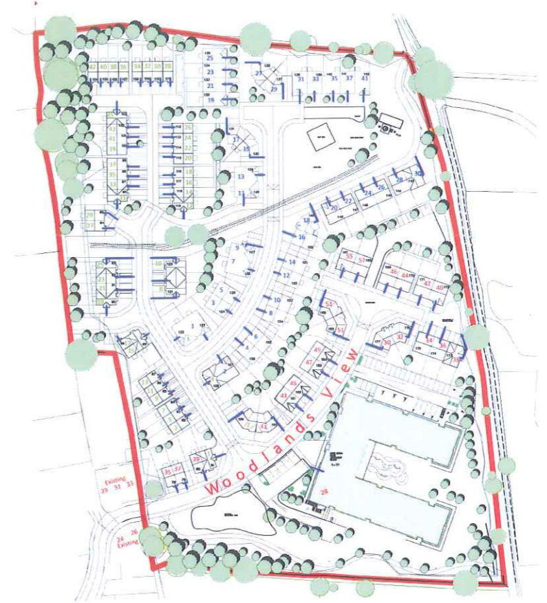
PROPOSED LOCATION PLAN (1:1250)